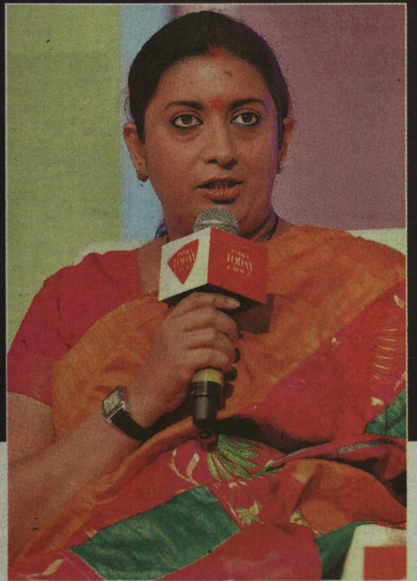
HRD Minister Smriti Irani (right) announced on Saturday that the daily wagger's sons need not pay the registration fees.